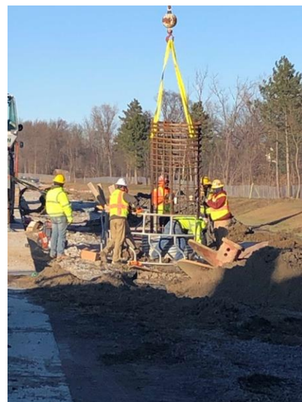
Winter Sound Wall Foundation Work – Placing & Installing pre-tied cages