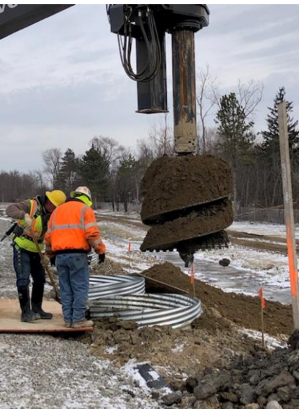
Winter Sound Wall Foundation Work – Drilling holes with auger