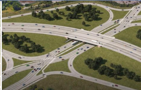
Big Beaver Diverging Diamond Interchange